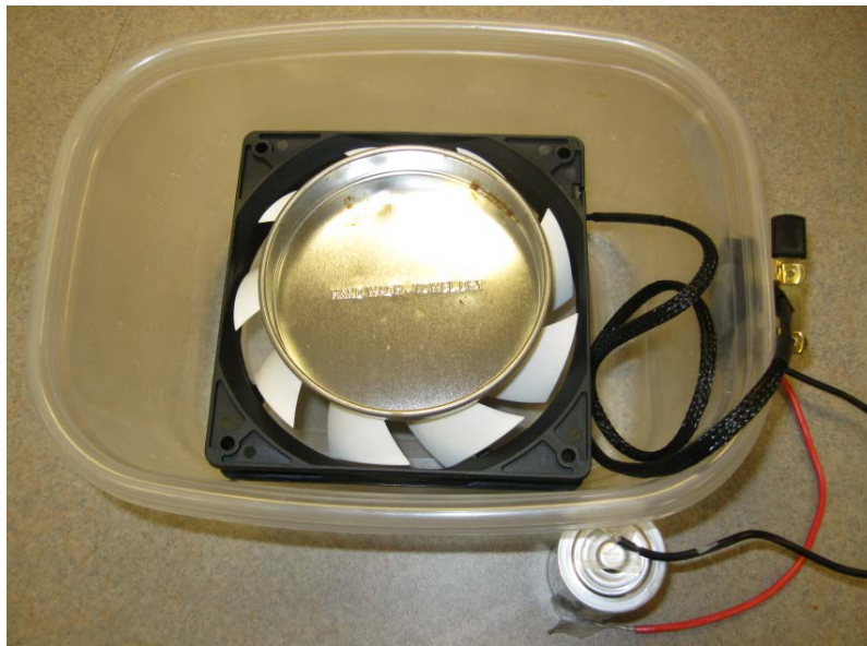
Container (empty in above picture) loaded on “spinner” device